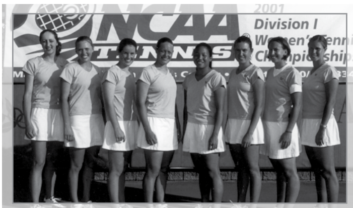
The 2001 Husky team was the first to win an NCAA tournament match, but did not stop with one, advancing all the way to the NCAA quarterfinals.