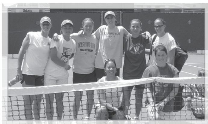
The 2003 Huskies on the practice courts in Florida, where they were set to compete in the round of 16 after sweeping Southern and Illinois at Regionals.