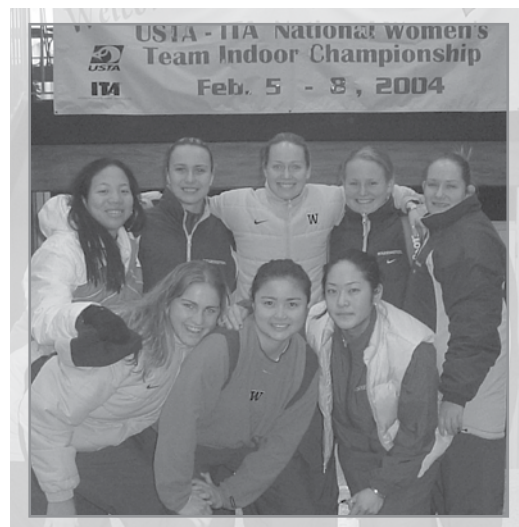
The Huskies placed third at the 2004 National Team Indoor Tournament, falling in the semifinals to eventual NCAA Champion Stanford.